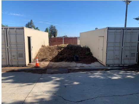
Shipping Containers (2)