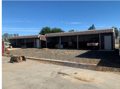
Loafing Sheds (2)