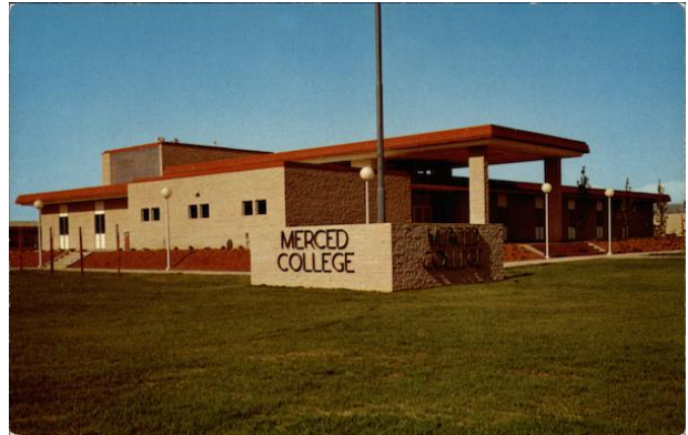
Merced College Administration Building in 1978

When California achieved statehood in 1850, Mariposa County covered much of the valley, extending to a mutual boundary with San Diego and Los Angeles counties. In 1855, lowland farmers decided they did not have much in common with the miners of the foothills and mountains and petitioned to have a section split off to form a new county. When the petition was granted, Governor John Bigelow formed Merced County on April 19, 1855. According to the 1857 tax assessment rolls, the new county hosted a population of 277 with the first county seat located in Snelling. Once the railroad came through the county, much of the business and the county seat moved to the new town of Merced, which was incorporated in 1889. Since that day, growth and change has continued in Merced County.