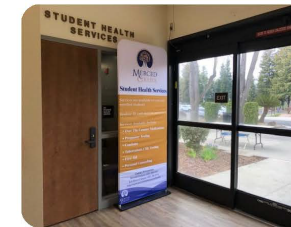
Merced Campus Student Health Services – Student Union Building Phone: (209) 384-6045

Student Health Services provides free TB testing & flu vaccinations to current Merced College students who have paid their Student Health Fee. Contact them for current offerings and to schedule an appointment.